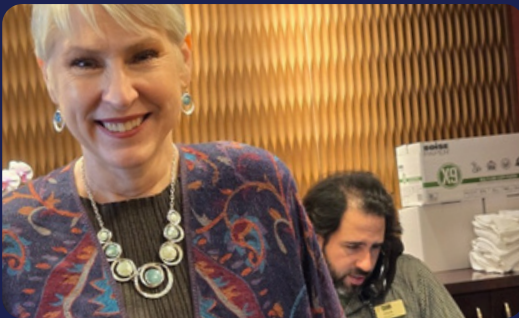
Aljoja Thornton Place