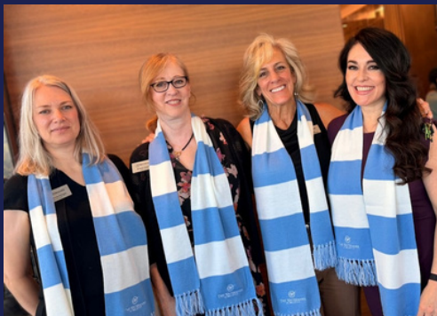
The Watermark team