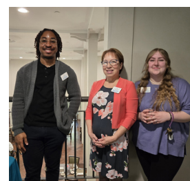
Team at Solstice Senior Living Normandy Park