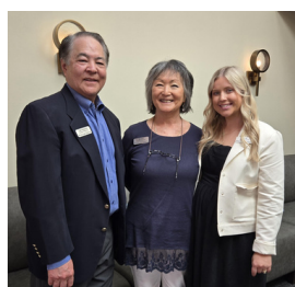
Team at Woodland Terrace

The Senior Care Coalition networking meetings in May were a fantastic opportunity to connect, share, and learn from one another. Both the Eastside meeting at Woodland Terrace on May 6th and the gathering at Solstice Senior Living on May 20th sparked meaningful conversations about navigating challenges in our work, asking thoughtful questions, and gaining deeper insight into each other's businesses. It was also a pleasure to visit and explore both Woodland Terrace and Solstice, and to see firsthand how they highlight their communities and the valuable resources they offer to seniors. A big thank you to both hosts for welcoming us and supporting our growing network!